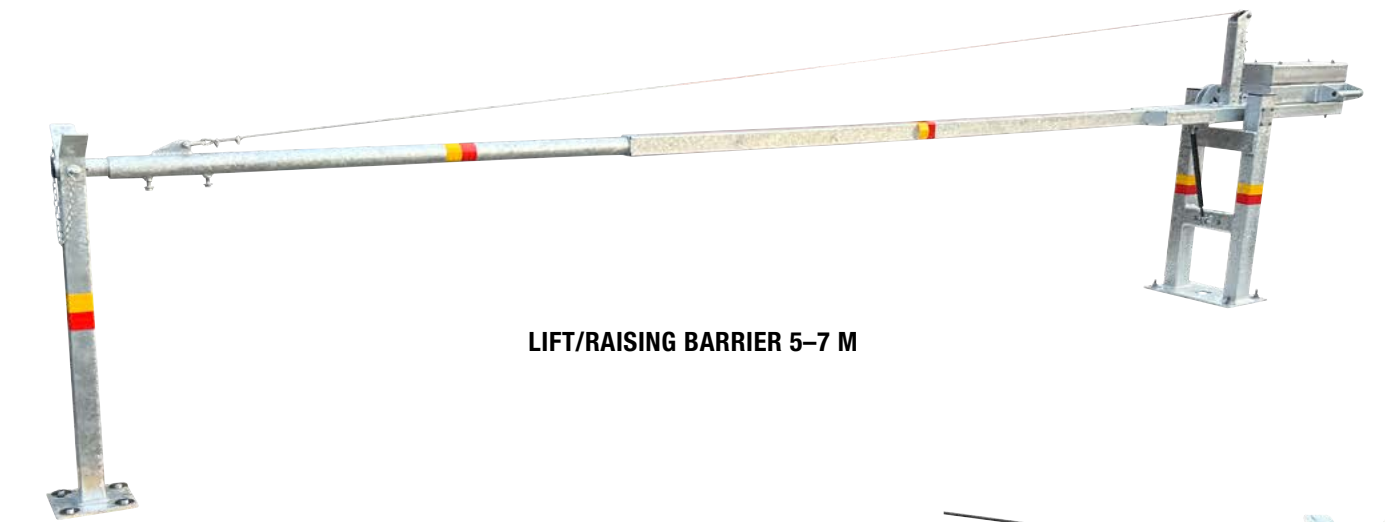
LIFT/RAISING BARRIER 5–7 M

Produced in HDG steel. The barrier arm and posts are equipped with reflex (red/yellow). Counter weight adapted for opening width 5-7 m. The barrier arm can be locked both in open and closed position. The posts welded on a base plate for direct fixation on concrete foundation.