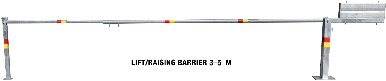
LIFT/RAISING BARRIER 3-5 M