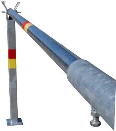
Adjustable arm length.

Produced in HDG steel. The barrier arm and posts are equipped with reflex (red/yellow). The barrier arm is adjustable for opening width 3-6m. For wider openings - double barrier installations are possible. The barrier arm can be locked in closed position. If locked in open position is requested an additional end post/posts needs to be ordered. The posts are welded on a base plate for direct fixation on concrete foundation.