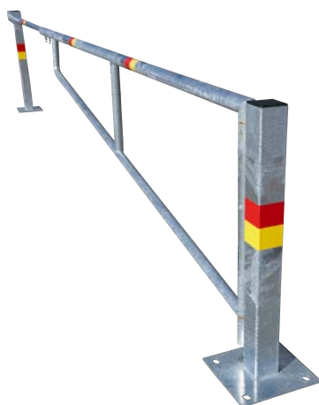
Hot Dip Galvanized

Our high quality products offers long life time, resulting in a financially good investment for the customer.